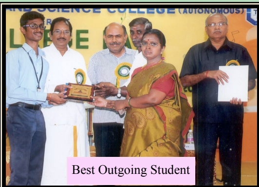
Best Outgoing Student