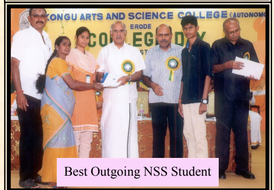
Best Outgoing NSS Student