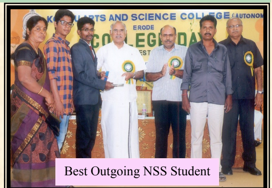
Best Outgoing NSS Student