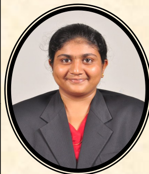
University Rank Holder