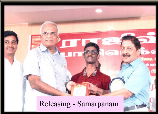
Releasing - Samarpanam