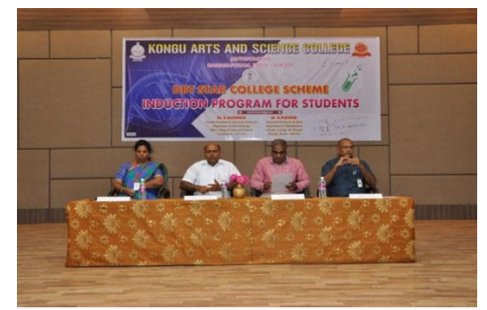
கொங்கு கலை அறிவியல்கல்லூரியில் உயிரி தொழில்நுட்பத்துறை தொடக்க விழா