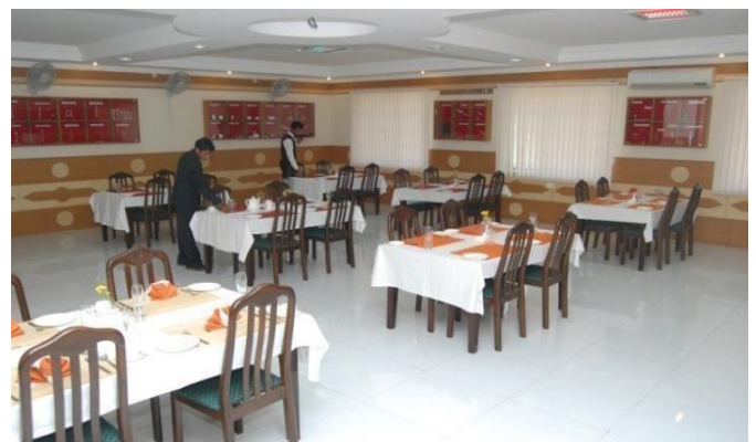
Catering – Restaurant