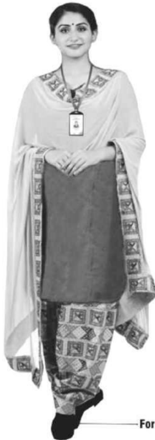
Formal black cut shoes