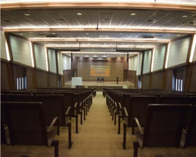
U. V. Swaminathaiyar Arangam