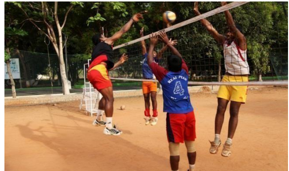
Volley Ball Court