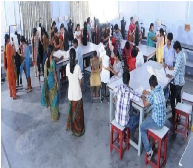
Textile Testing Lab