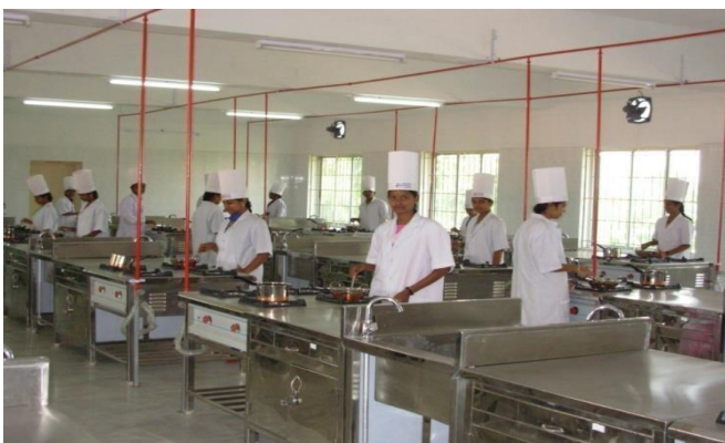
Catering – Training Kitchen