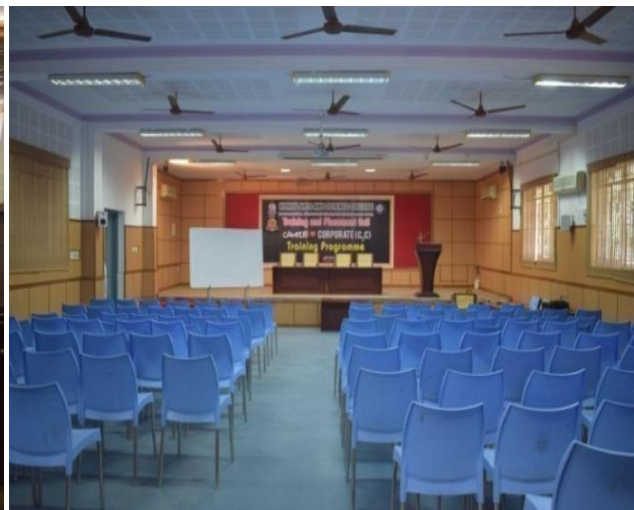
PG Seminar Hall