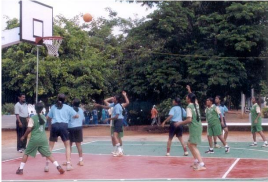
Basket Ball Court