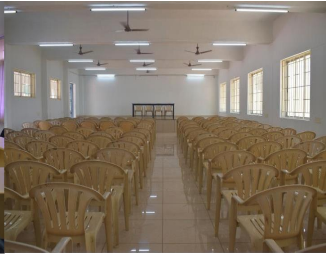
Science Block Seminar Hall