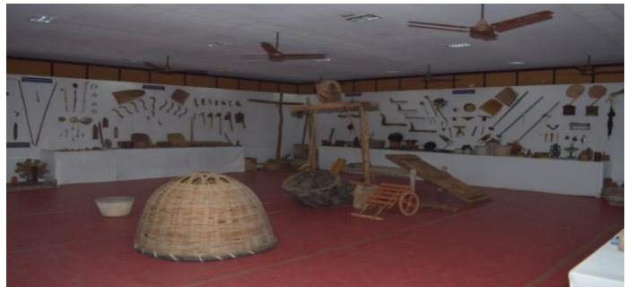
Kongu Art and Culture Centre