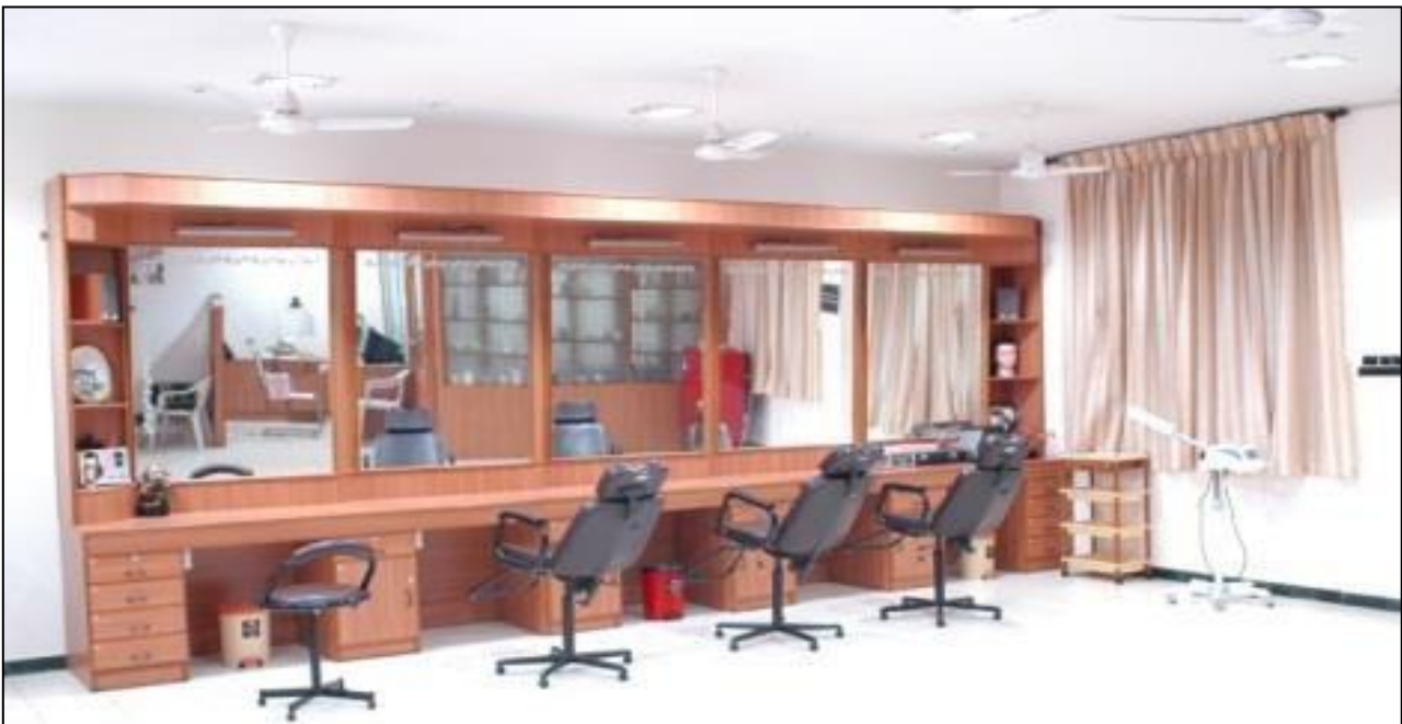
Kongu Beauty Clinic