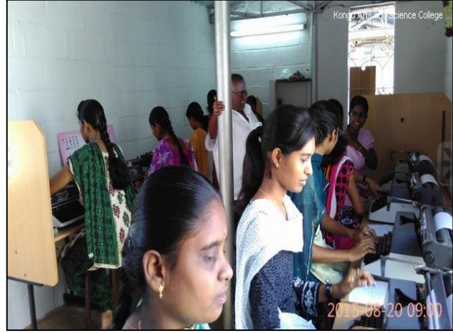
Kongu Typewriting School