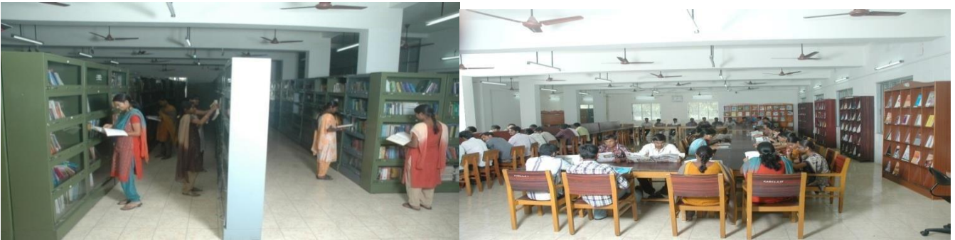
Central Library Centres and Laboratories