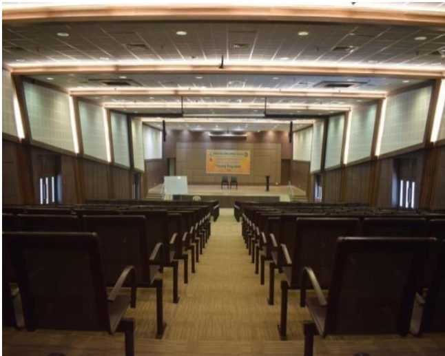
U. V. Swaminathaiyar Arangam