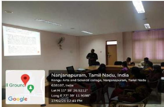
1. First Council Meeting on 27/2/2021