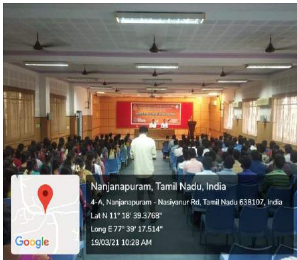
4. Mentorship Session for Innovators on 19/3/2021