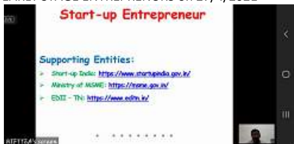
9. INCUBATION OPPORTUNITIES FOR EARLY STAGE ENTREPRENEURS on 27/4/2021