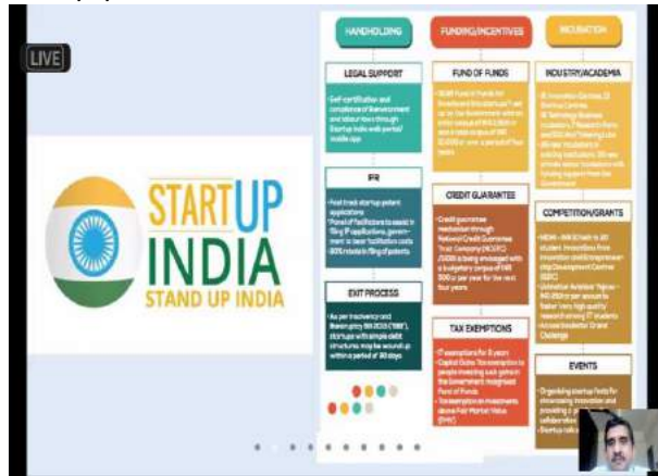
6. Online Webinar “Roadmap for Successful Entrepreneur” on 24/3/2021