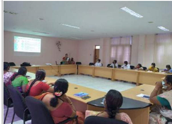
8. MIC Driven Activity in association with Ministry of Entrepreneurship