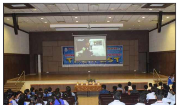
MY STORY MY CONTENT