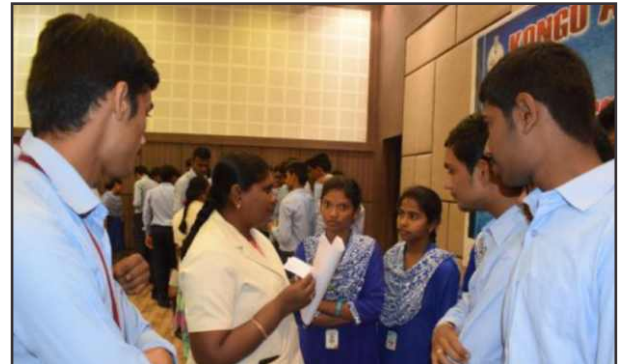
HUNT THE QUEST