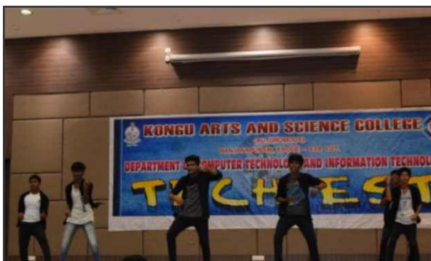
TIME TO TAP